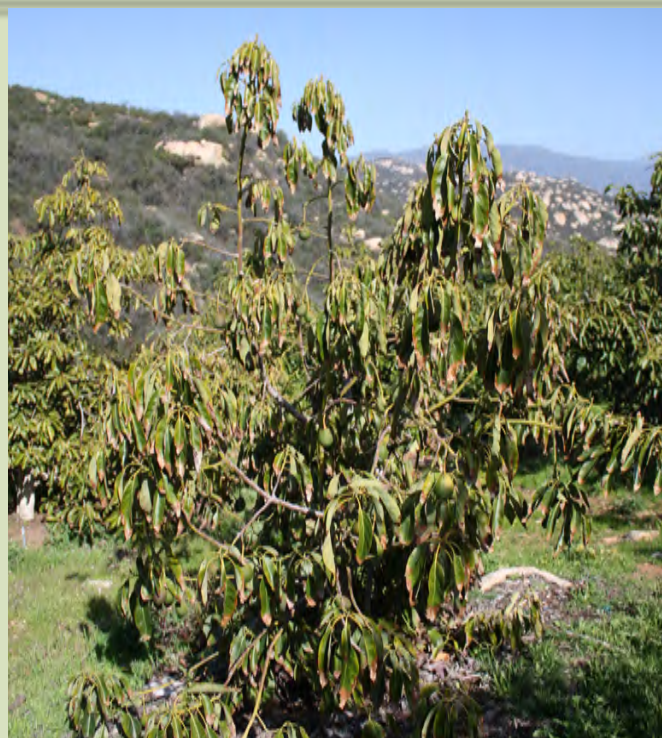
Fig 1. Phytophthora root rot symptom on a young tree