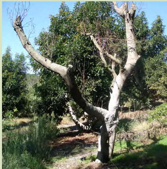
Fig 2. Phytophthora root rot symptom on an older tree