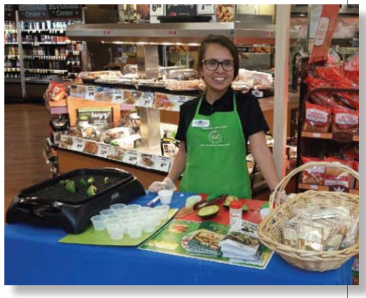
A Kroger RDN showcased grilled California avocados at King Soopers/The Little Clinic Diabetes Wellness Festival.

Top tier retailers celebrated California Avocado Month with in-store events, television appearances, email blasts and giveaways that provided customers with new usage ideas, recipes and nutritional information. As part of the celebration, CAC distributed 4,000 copies of Superfood Spotlight: Making Mealtime Easy for Moms to 40 SRDs at 12 top tier retailers. Those retailers included Albertsons, Balls Food Stores, Dierbergs Markets, Harmons, HEB, Hy-Vee, King Soopers/The Little Clinic, Lunds & Byerly, New Seasons Market, Northgate Markets, PCC, Save Mart and Schnucks.