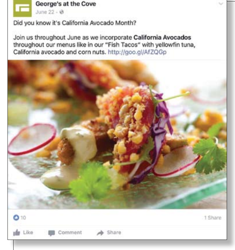
George's at the Cove in San Diego celebrated California Avocado Month on its social media channels and with unique California avocado specials on its menu.

Portland-based New Seasons Market featured California Avocado Month in its June "Newstrition" e-newsletter and on its website, and included a link to Guacamole Potato Salad on CaliforniaAvocado.com. The Nutrition Educator for PCC Natural Markets in Seattle provided customers with CAC's Wake-up to Breakfast recipe booklet, recipe tear pads and California avocado cutters. Harmons' RD distributed the California Avocados Plant-based Diet recipe booklet at the National Senior Health and Fitness Day held in Salt Lake City, Utah.