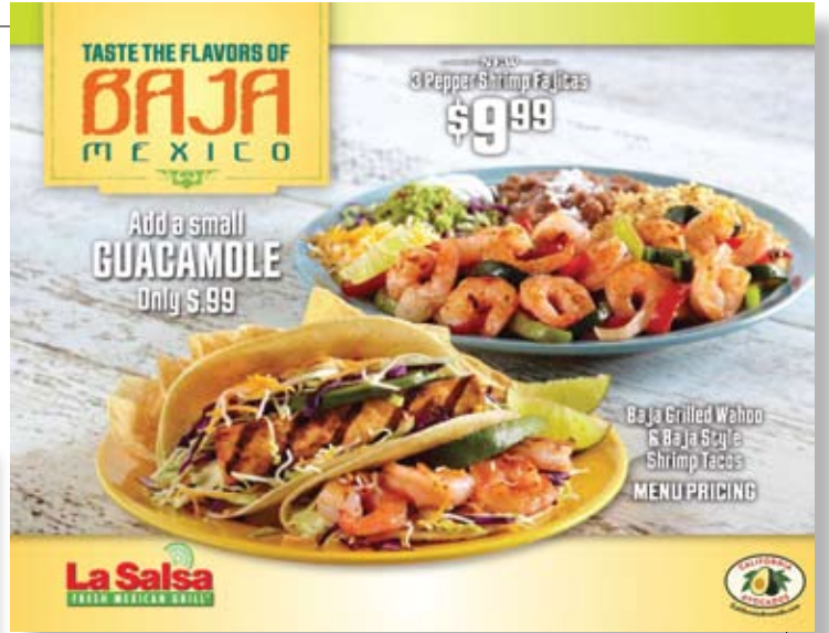
La Salsa's Grilled Wahoo and Baja-style Shrimp Taco menu boards were placed in 40 locations.

The Egg & I's "Spring Fresh: New Season. New Flavors." LTO menu provided customers with the opportunity to begin their day with California Avocado Toast . One-hundred-sixteen locations featured the breakfast item from March 28 to May 29.