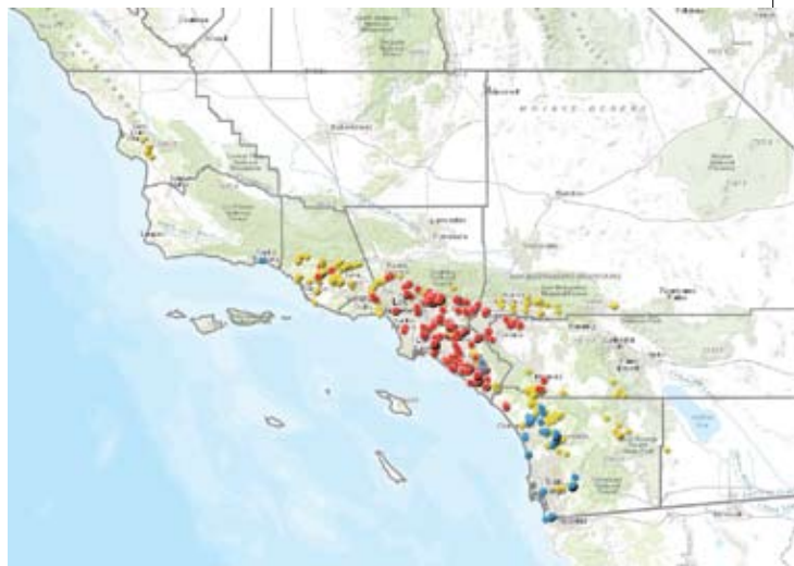
Shot Hole Borer distribution