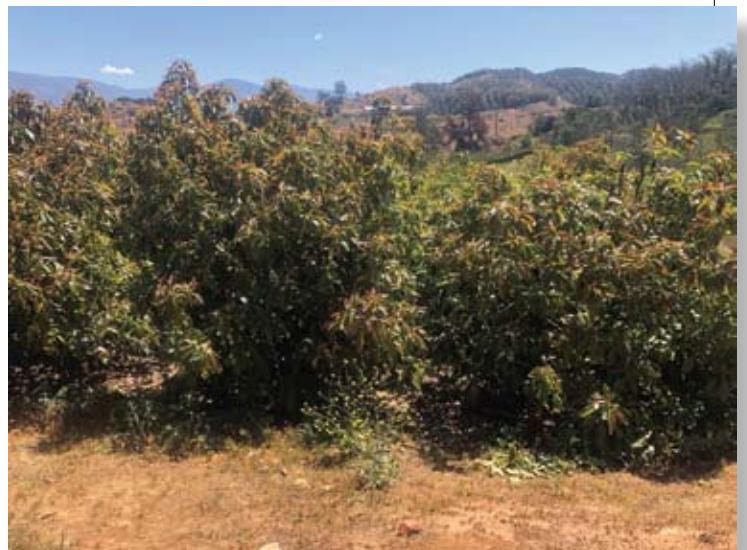
High Density Avocado Planting in San Diego.