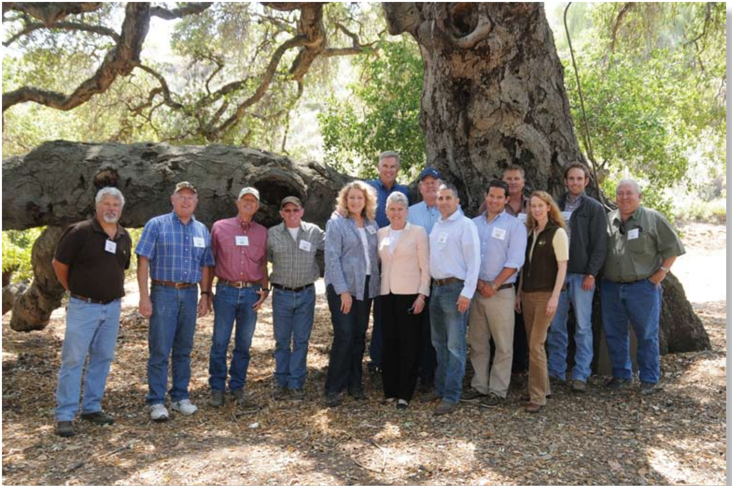
Ventura County growers and commission staff meet with Congresswoman Brownley in Fillmore