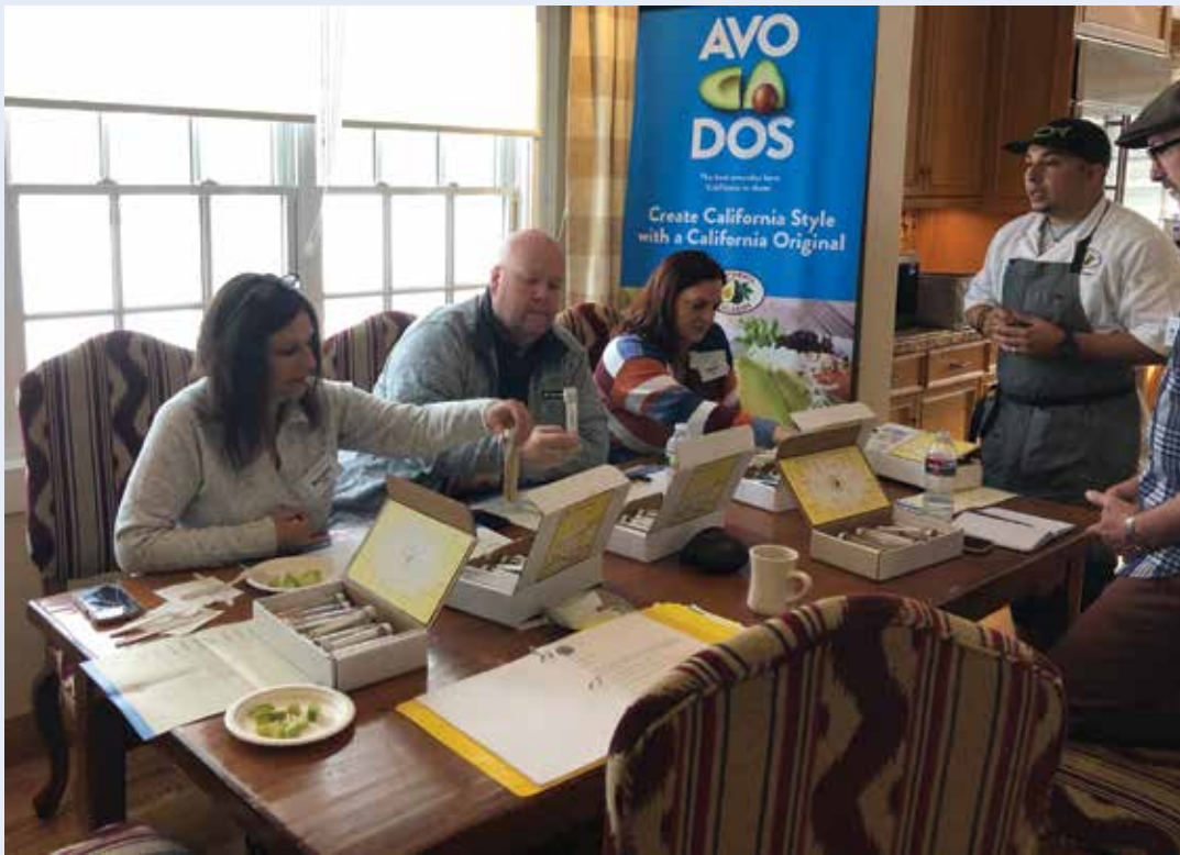
The Commission's California avocado flavor pairing sessions were in high demand at foodservice industry events.