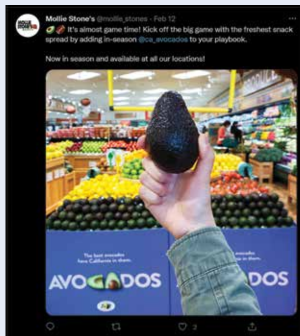
Early season Big Game promotions helped secure distribution of a high volume of early season fruit and build demand leading into the peak season.