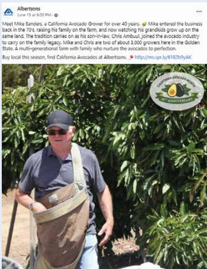
Top tier retailers integrated digital and social campaigns showcasing California avocado growers and linking to CAC's online store locator tool garnered more than 700,000 impressions.

we resurrected ALB research to examine the phenology of the pest, identify natural predators, study the effects of temperature on the pest and complete molecular studies to help us identify its geographical origin. The Commission also is developing early detection tools for the avocado seed weevil.