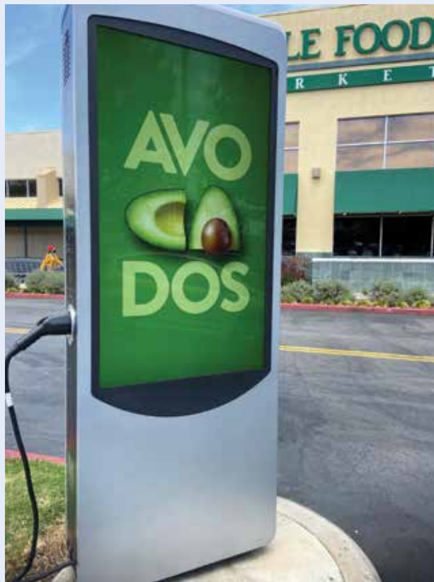
The Commission continued its successful “the best avocados have California in them” with refreshed graphics and new campaigns shared on high-traffic Volta charging stations to reach shoppers on their way into the grocery store.

sphere, building a collection of branded social media channels that have become a powerful means of engaging with consumers at home, on the road or out in the community. Content was carefully cultivated to immerse the California Avocados brand in key cultural moments (e.g., the Big Game, Cinco de Mayo) with on-trend recipes, how-to videos, links to CAC’s store locator landing page and lifestyle posts shared on its Facebook, Instagram, Pinterest and Twitter channels. Facebook re-emerged as an impactful means of engaging with consumers, reporting a 45% increase in impressions versus last season. Twitter and Instagram followers remained steady, while YouTube video views saw a 13% increase over the previous year. CAC also launched a TikTok channel to engage with a younger consumer base that flocks to the video-centric social network. The Commission partnered with Kelz, an influencer cherished for his candid and entertaining recipe assessments, on a Cali-