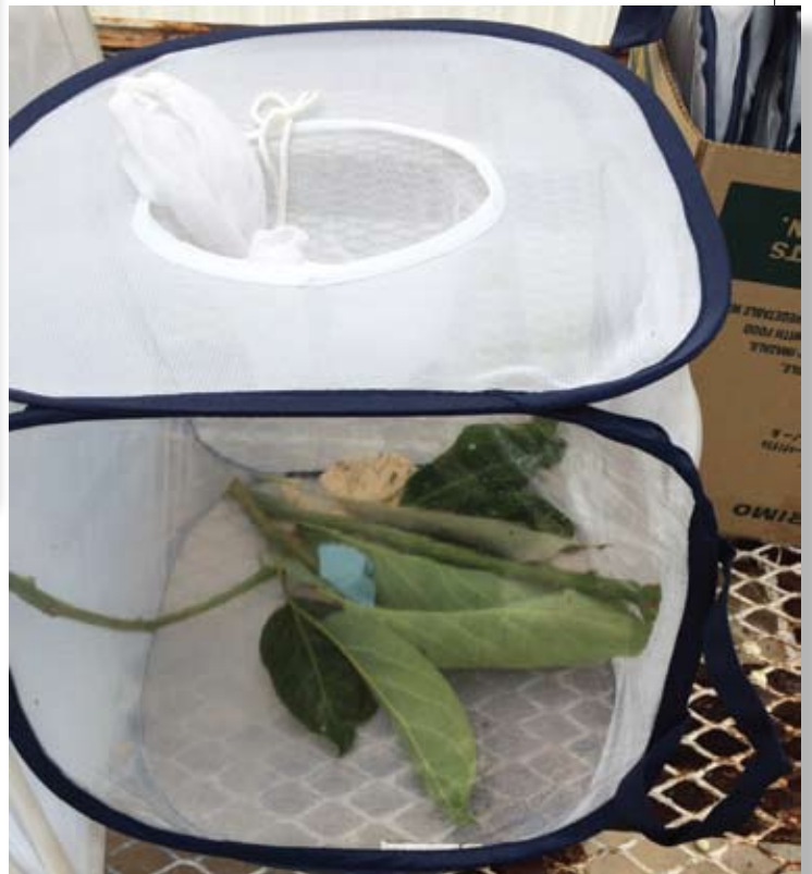
"Bug Dorm" used to house treated avocado wood for PSHB bioassays

The previous Commission-funded research provided a good platform to build on and we began the process of determining if any currently-registered materials for avocado may prove efficacious in the field. At the same time, field testing of non-registered materials began, with a goal of identifying possible pesticide and/or fungicide materials that may provide either curative or prophylactic benefit.