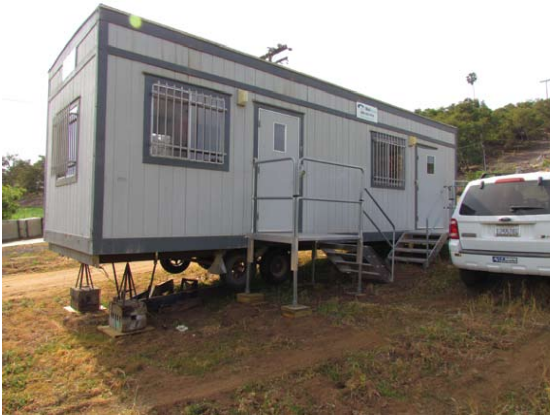
A field trailer where PSHB research is being conducted

near an infestation and will become more vigilant in their PSHB scouting activities; and third, by gathering data University of California at Riverside (UCR) researchers will be able to develop life-cycle and beetle movement models. As an example, during January as UCR researchers monitored 15 traps, the average total number of beetles was around 100. But, in early February, when the temperature warmed, those same 15 traps had more than 1,000 combined beetles in one day. Although this data is preliminary and needs to be further developed, it indicates how quickly the beetle movement can increase and population numbers explode.