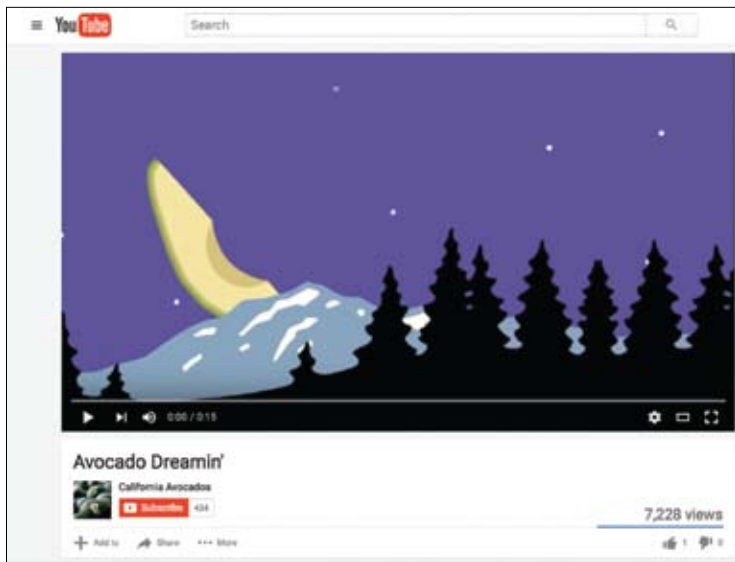
An example of CAC's pre-roll video ad on YouTube

These custom overlay ads provide California avocado recipes and encourage the viewers to visit their nearest store (using their zip code) to find California avocados. To further promote California avocados, the Commission designed cover photos for its Facebook, Twitter and YouTube channels featuring the artwork created by Schwab.