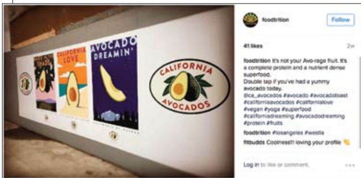
A social media share of CAC’s wild posting ads from @foodtrition on Instagram