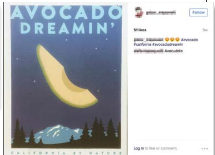
An avocado fan on Instagram sharing one of the Commission’s wild posting ads

This season, CAC is using a guerilla marketing tactic known as “wild postings”. Wild postings are a relatively inexpensive and efficient form of advertising using a large number of the same or related posters placed together, usually in urban locations, to attract attention and gain added exposure. California avocado posters have been placed in high-traffic areas within CAC’s targeted markets – Los Angeles, Sacramento, San Diego and San Francisco – to encourage consumers to photograph themselves in front of the signs and share those images on social media. This strategy is called “show and share”.