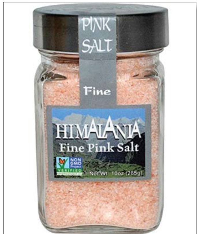
A bottle of salt with a misleading "non-GMO verified" label. Salt is a mineral containing no DNA and thus cannot be genetically modified since it has no genome.

Perhaps even more difficult than overcoming public perception is overcoming the regulatory hurdles to get geneti-