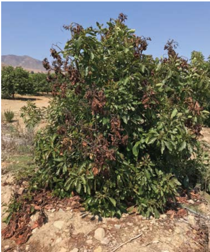
A 4-year-old Hass tree at Pine Tree Ranch, Santa Paula, showing heat damage to several branches.

noon in both locations. Their data show that avocado stomates begin to close when air temperatures rise above about 88 °F.