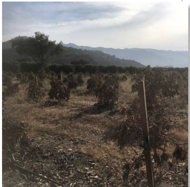
Young 'Gem' trees killed by the extreme heat in Ojai.

The most devastating aspect of this heatwave was the timing. Most trees were beginning to produce this year's summer flush when the heat hit. This year's summer flush is