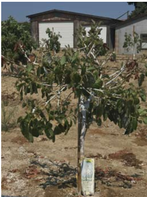
A young tree well whitewashed to protect exposed branches from sunburn.

where the spring 2019 bloom will set to produce the 2020 crop. Thus, the effects of this heatwave will be felt for several years.