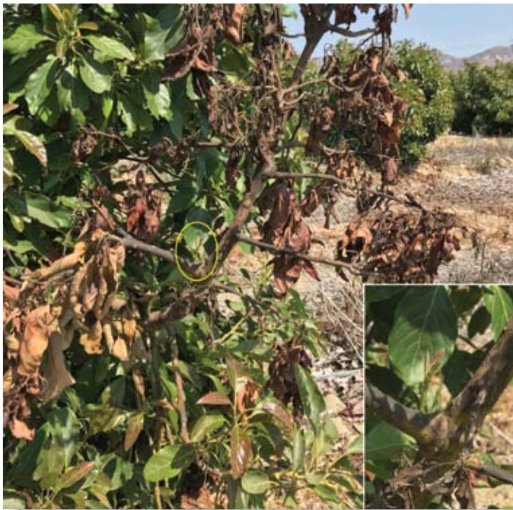
A heat damaged branch on a 4-year-old Hass tree, 35 days after the heatwave. The young shoot (yellow circle and inset) developing at the base of the damaged branch indicates where the living tissue is. This branch should be removed by pruning just above the new growing point.