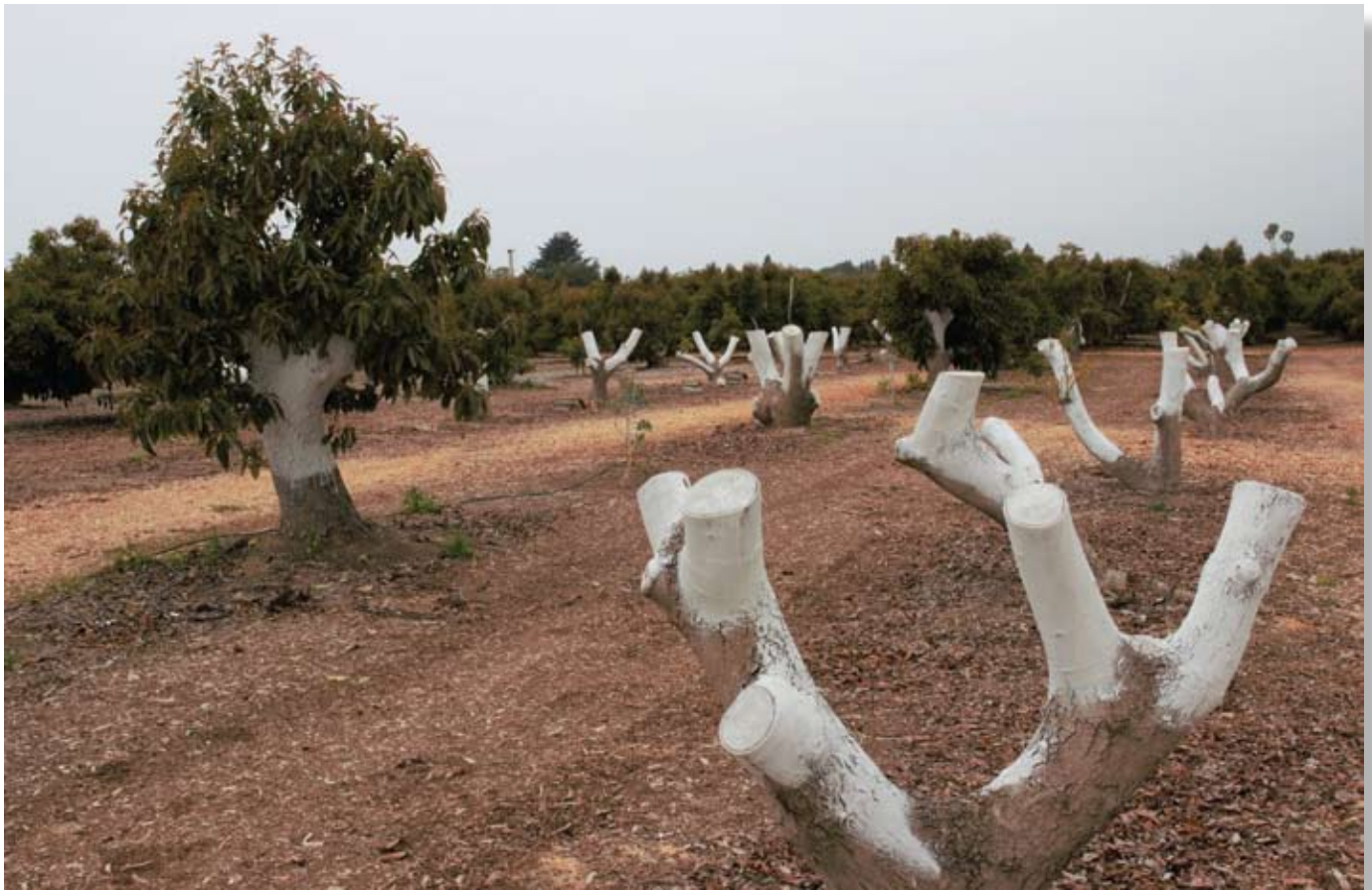
Dal Pozzo Ranch looking southwest. Shows some of the trees stumped in February-March 2021, a few of the trees stumped last year and a few of the new trees planted in April 2021.