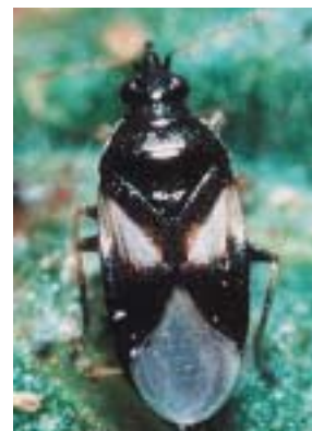
A minute pirate bug, Orius sp.