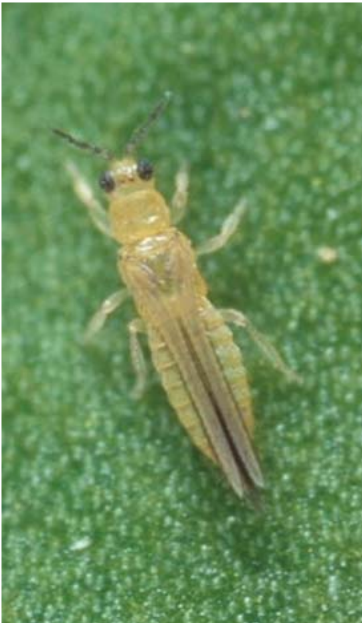
Avocado thrips, Scirtothrips perseae

In 1971, a quarantine interception at the Port of San Diego resulted in the collection of a single female specimen of an undescribed species of Scirtothrips on avocados from Oaxaca in southern Mexico. This single specimen is very similar in appearance to avocado thrips found in California. Adult S. perseae may occasionally be found resting on non-avocado plants in heavily infested avocado orchards. Avocados are native to Central America, and humans have moved plants out of this region into South America, the Caribbean, and elsewhere. Foreign exploration efforts for avocado thrips and its natural enemies in the native range of avocados have shown that S. perseae has a narrow geographic distribution, and is found throughout the avocado growing region between Michoacan in Mexico and central Guatemala. Avocado thrips has not been found on avocados in Costa Rica, the Dominican Republic, Trinidad, Brazil, or Chile.