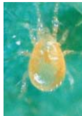
The predatory mite, Euseius hibisci

Foreign exploration for avocado thrips natural enemies (predator thrips and parasitoids) in Mexico is ongoing. A thrips parasitoid, Goetheana incerta , a natural enemy of South African citrus thrips, Scirtothrips aurantii , is being studied in quarantine at UC Riverside. Rearing and evaluation work with G. incerta against avocado thrips in quarantine is in progress.