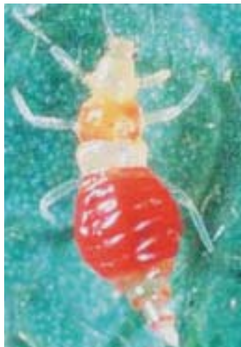
A larval, Franklinothrips n. sp.

12 larvae/leaf. In this study, a major problem identified was the poor quality of the predator after shipping from Europe to California. After transit > 50% of adults had died and survivors were probably of marginal health. In two later studies, weekly releases of Franklinothrips at a rate of approximately 50 adults per tree failed to control avocado thrips at initially low (1 thrips per leaf) and high densities (25 thrips per leaf) at sites in Escondido and Ventura, respectively. In these studies, a major problem was a lack of consistent thrips populations at densities that could support predator population growth – the low-density populations did not develop and the high-density populations crashed soon after the trial started. Further research is needed, but at present we cannot verify effective control of avocado thrips field populations with either lacewing or Franklinothrips releases.