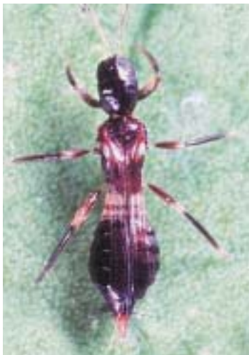
An adult female, Franklinothrips n. sp.

In an initial experiment, two releases of Franklinothrips at 218 adults per tree failed to control avocado thrips at densities of