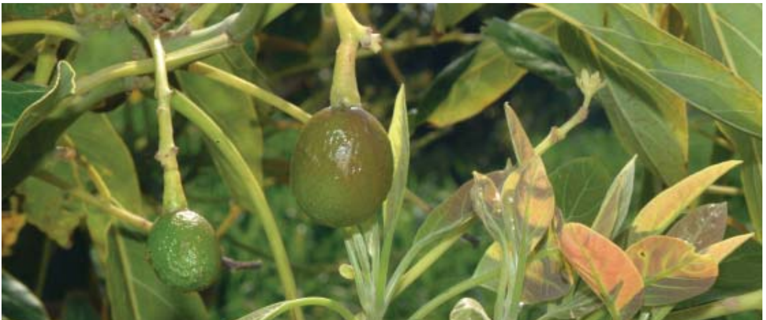
Female avocado thrips will lay eggs into young fruit and leaves. Feeding by emerged larvae can cause economic damage to fruit, depending on the number of thrips present and how long they feed.

Female avocado thrips will oviposit into young fruit and feeding by emerged larvae can damage fruit, depending on the number of thrips present and how long they feed. Observation of field-collected 'Hass' fruit in the laboratory indicates that females will lay eggs in fruit ranging from 0.16-3.0 inches in length. The majority of larvae (>95%) will emerge from fruit 0.59-2.5 inches in length, with the highest numbers emerging from fruit 1.5-1.7 inches in length. Observations in the field on 'Hass' indicate that fruit 0.8-1.6 inches are most preferred by avocado thrips, possibly because fruit of this size have a reduced propensity to drop prematurely from trees and they are still tender enough for oviposition and larval feeding. Once fruit exceeds 2 inches in length, avocado thrips adults and larvae are found primarily on young leaves. In the field, fruit are most susceptible to damage when fruit are 0.2-0.6 inches in length. Based on a 'Hass' study in Ventura County, when approximately 3-5 thrips are consistently found per leaf 97 days, 75-36 days before fruit set, and during fruit set, feeding will cause 26-38%, 18-28%, and 6-15% economic scarring damage on fruit, respectively.