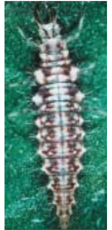
A predatory green lacewing larva

Laboratory work on Franklinothrips has identified the optimal temperatures, diets, harvesting of pupae, and automated sorting of pupae, techniques that are applicable to cost-effective mass rearing this predator. Adult Franklinothrips females can eat approximately 14-20 second instar avocado thrips larvae in a 24-hr. period. This predator does not show a feeding preference for first or second instar avocado thrips larvae. Both life stages are equally likely to be attacked after the predator encounters them. Franklinothrips spend around 2-5% of their time probing avocado leaves with their mouthparts. This observation may explain, in part, why Franklinothrips populations decline following applications of insecticides that exhibit translaminar activity (Agri-Mek and Success). Leaf feeding in this manner may expose Franklinothrips to insecticides that have moved into leaf material, thereby killing them.